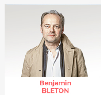
Author - Unac