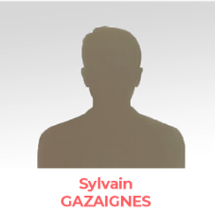
Publisher - Sacem