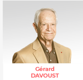
Publisher - Sacem