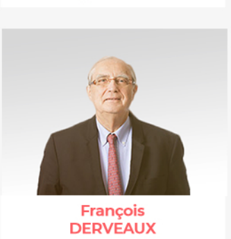
Publisher - Aeedrm