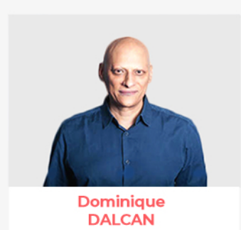
Composer - Sacem