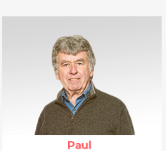
BANES Publisher - Addr